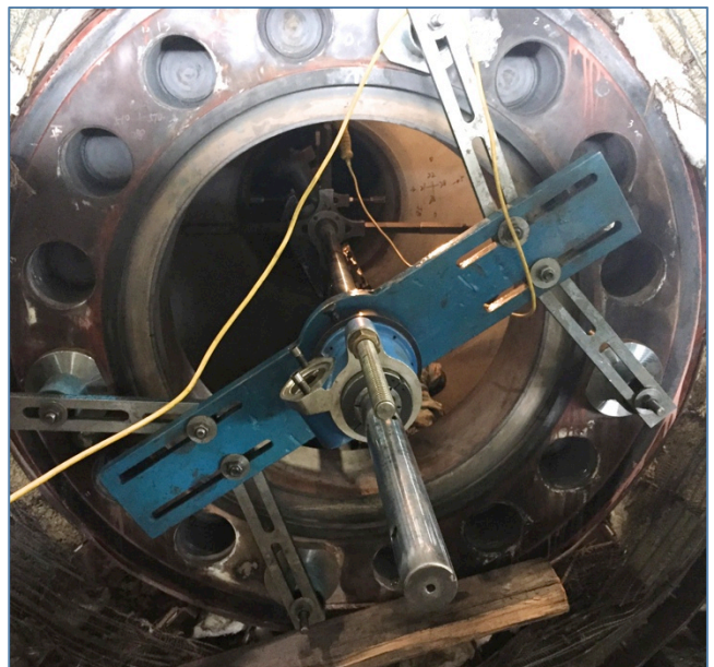
Pre-machining the valve seat of HPSV