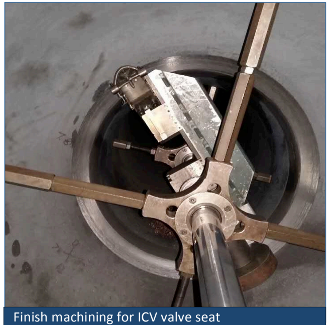
Finish machining for ICV valve seat