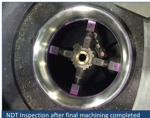
NDT Inspection after final machining completed