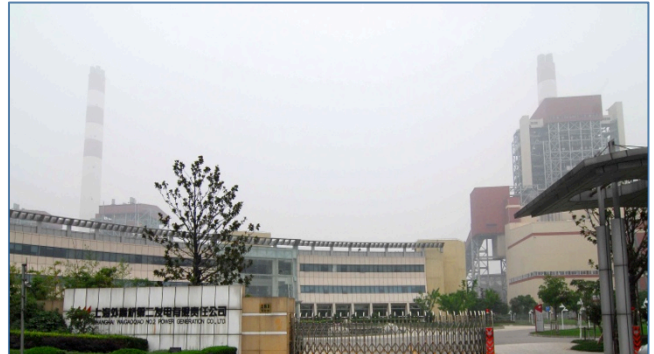
Shanghai Waigaoqiao Power Plant III